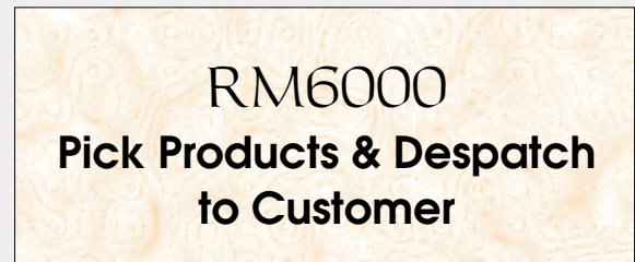
RM6000 Back Office Location